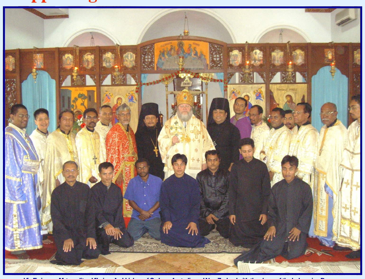
His Eminence Metropolitan Hilarion, Archbishop of Sydney, Australia and New Zealand with the clergy of the Indonesian Deanery in Holy Trinity Church, Solo, Central Java, Indonesia. Built in 1996 Holy Trinity was the first Orthodox church erected in Indonesia.

Supporting the Indonesian Orthodox Church